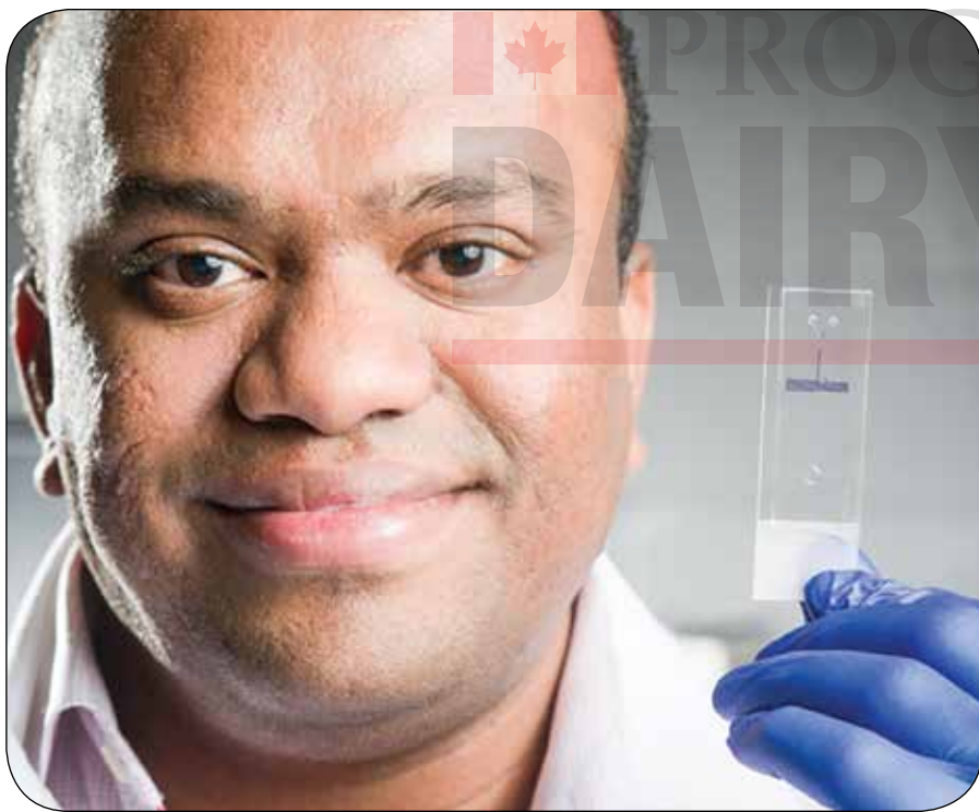
Dr. Suresh Neethirajan displays the sensor device to test for subclinical ketosis.