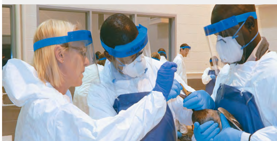
Participants in an avian influenza course from the U.S. Department of Agriculture practice swabbing wild ducks for diagnostic sampling.

No Comments Posted Apr. 24th, 2015 by Dan Yates