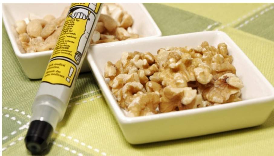
The wallet-sized device can detect peanut and gluten allergens in food.

CBC News Posted: Jul 04, 2016 1:00 PM ET | Last Updated: Jul 04, 2016 1:00 PM ET